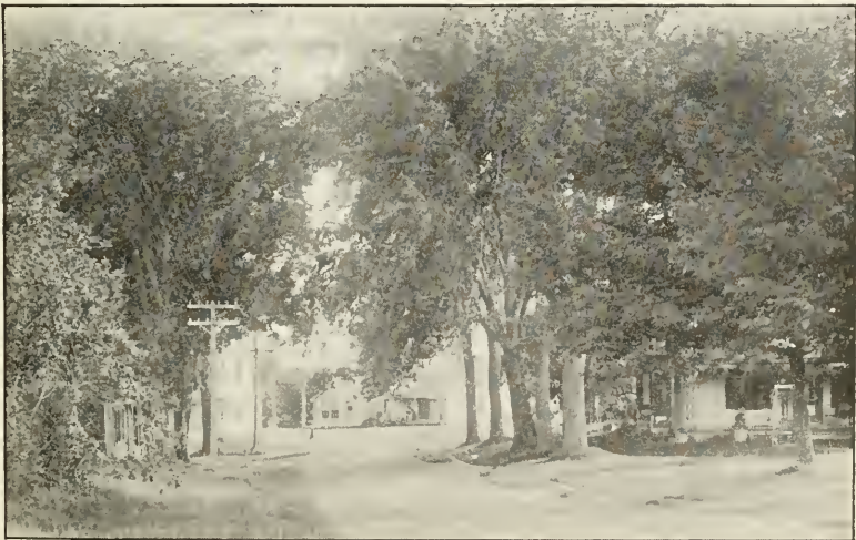
Street in Windham Center